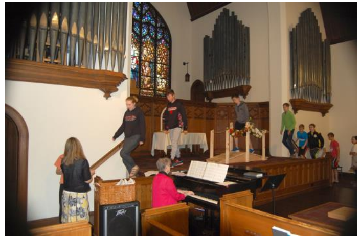
Our Whole Lives students graduate