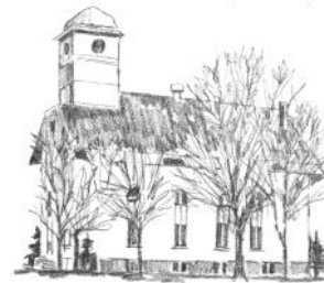
THE FIRST CHURCH (1872-1881)