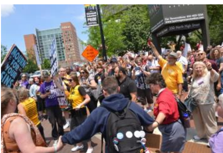
Participants from General Assembly 2016 surround protesters from Westboro Baptist Church

General Assembly 2016 took place last month in Columbus, Ohio. You can find information about the event, including lectures and worship services here: UUA GA 2016 .