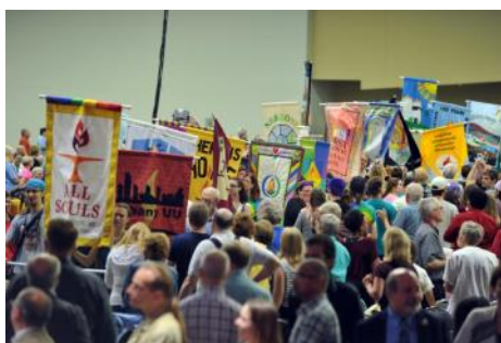
Banner Parade at the Opening Celebration