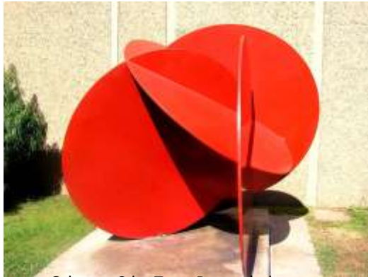
Odyssey 3 by Tony Rosenthal