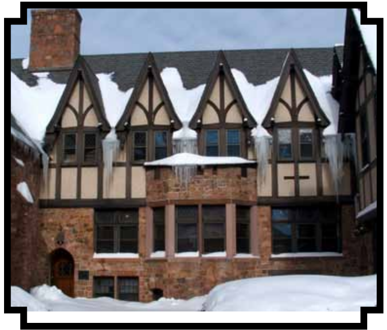
20th Century church in winter